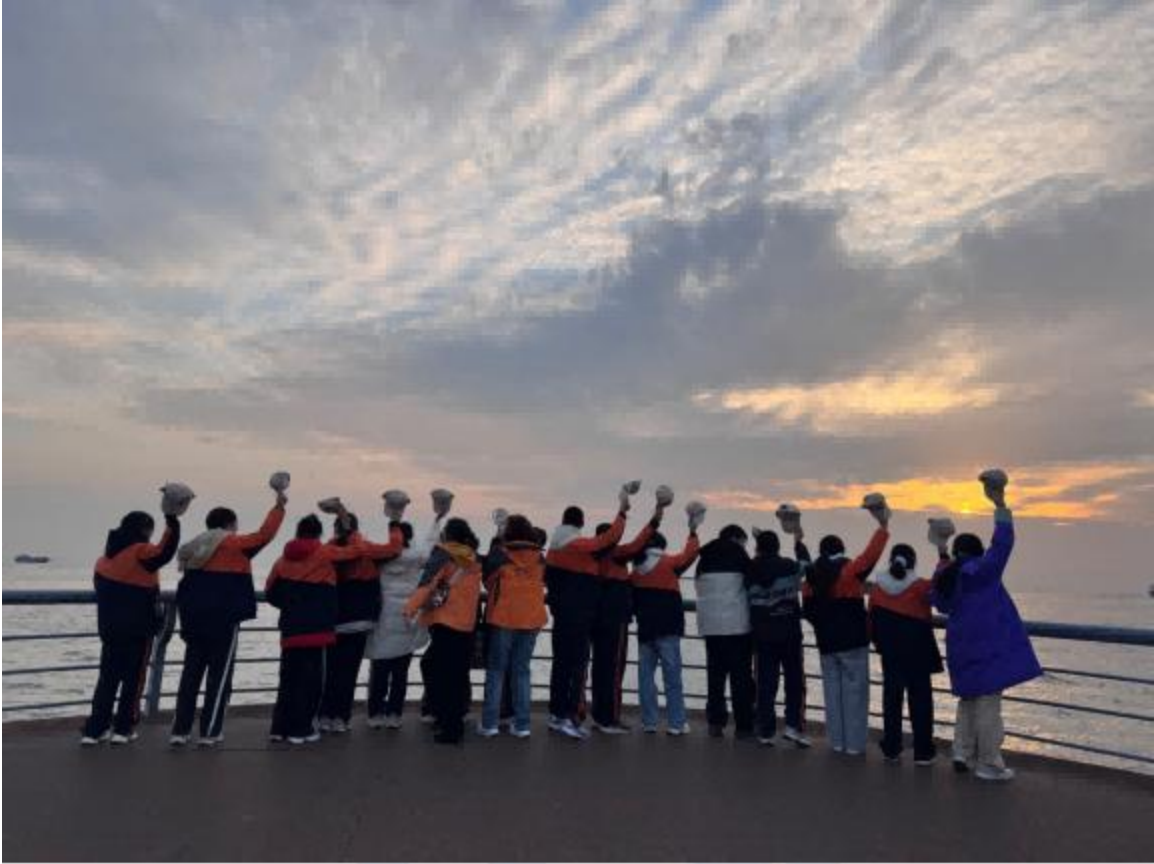
Students participating in the Nantong Educational Exchange Program during a sunset activity along the Yangtze River waterfront.